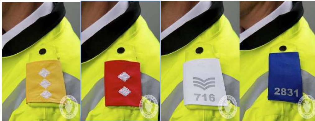
Figure 3: Coding schemes signifying differing command levels operable during public order events.

officers from multiple force areas. Below are some examples, yellow denoting a ‘Bronze’ commander, red a ‘PSU Inspector’, white a PSU ‘Sergeant’ and blue ‘Police Constable’ 68