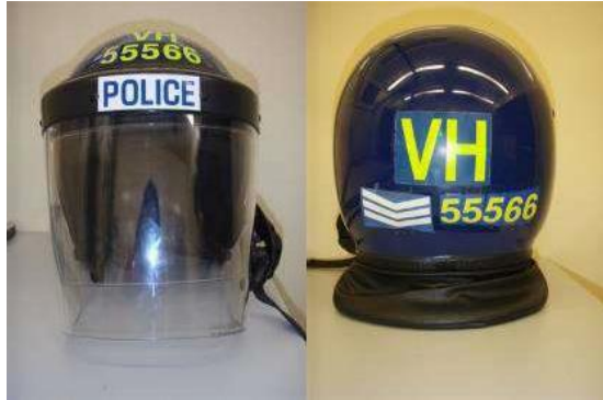
Figure 1: NATO style helmets with clear identifier codes for each individual officer.

for the officer's numbers. All these should be in yellow, with a dark blue background. The pictures below, copied from the Module G3 manual, show how these markings should look.