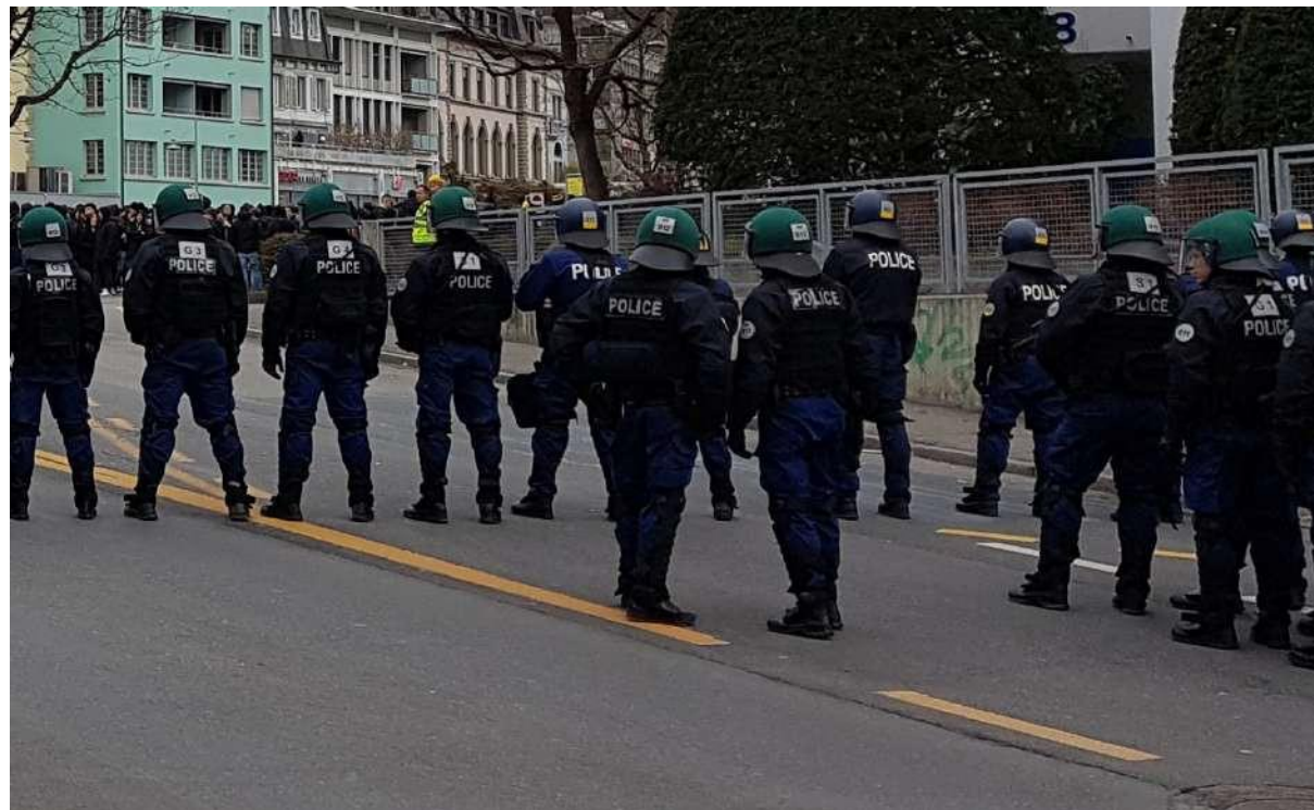
Figure 6: public order police officers of the Cantonal Police of Bern and their group assignment on the back of the helmet and of the uniform (in grey) .

The relevant group numbers are visible on the back of their vest and on the back of their helmet (see figure 3).