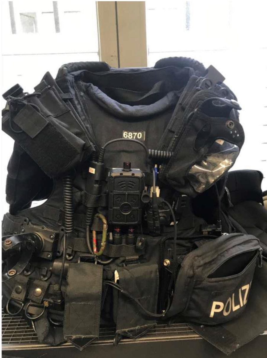
Figure 9: The positioning and size of the personal ID number on the public order vest of the Zürich City Police. (© Andreas Moschin, Stadtpolizei Zürich).

The list with the assignment is checked accordingly by the platoon leader. According to the information provided by the Zürich City Police, there is no exception where the police officers could resign from wearing their personal ID number. This whole principle has been in use for round about eight years. The demand for the identification of police officers originally came from left-wing circles at the political level, with specific reference to the constitutional law. For complaints about the police