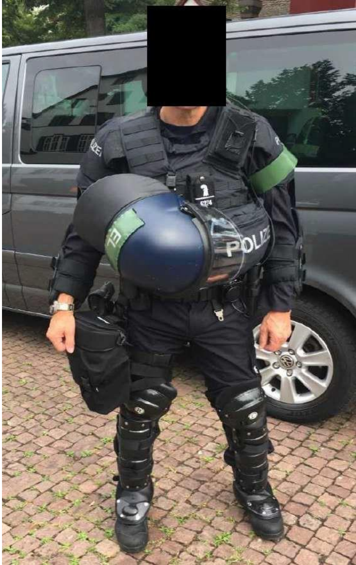
Figure 5: A police officer of the Basel-Stadt Cantonal Police – in this case the head of operations – with his public order uniform and the necessary individual identification at chest level (directly above the helmet).

This regulation applies to all ranks, including the head of operations. Excluded from the regulation are members of the special units (Art. 9 para. 3 PolV). The control of the correct wearing of the personal ID number is a management task and is usually taken over by the group leader. There is no independent inspection regime for the monitoring of police operations of the Cantonal Police of Basel-Stadt. Like all the other involved cantons, the Canton Basel-Stadt has an ombudsman who receives complaints regarding police actions or operations. In case of a complaint, the ombudsman