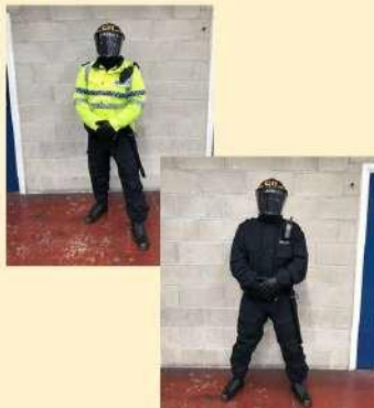
Figure 2: Three levels of uniform for public order policing offering increasing levels of officer protection

Full public order Personal Protective Equipment (PPE) including public order helmet. Flame retardant flash-hoods should be worn unless directed otherwise. High visibility tabards/jackets should be worn unless directed otherwise. Shields may be carried, as directed.