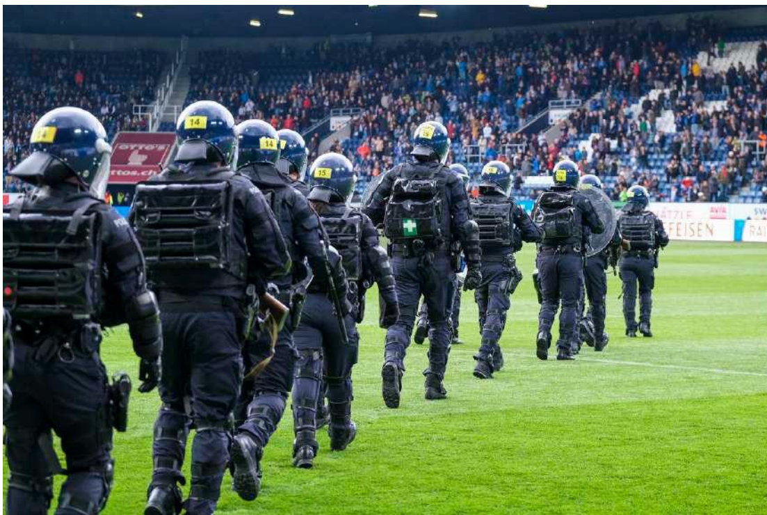
Figure 7: public order police officers of the Cantonal Police Lucerne and their group assignment in yellow on the back of the helmet

According to the information provided by the Cantonal Police of Lucerne, all police forces deployed in Lucerne must be identifiable. There are no requirements regarding colour or positioning. In Lucerne, identification is ensured by a visible ID number on the back of the helmet at the start of operations. Each member of a group (each group consisting of four police officers) is assigned a number. Due to the different functions within the group and the number, it is possible to identify the relevant police officer.